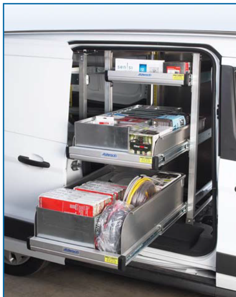
Side Katerack shelving measures 36"D x 21"W; 5.25 sq. ft./shelf

...the first step would be to take everything out!