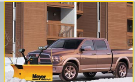
The Super-V D is designed to fit 1/2-ton vehicles which makes it perfect for plowing tight areas while providing the same performance of a regular size V-plow.

When you want the convenience of a "V" blade, a scoop blade or straight blade, you want a Meyer Super-V Plow. Available in three moldboard styles, Super-V Plows are built to take on the demanding tasks during changing conditions. With Super-V's one touch controller and dual-acting cylinders, you can put the plow in just about any configuration by pushing just one button. And each of its bottom-trip moldboards can trip independently for maximum performance.