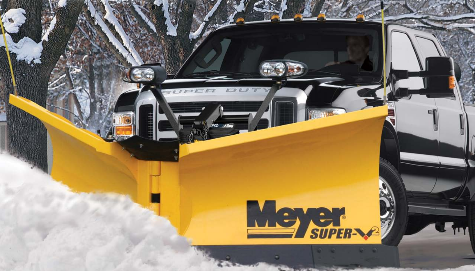
Meyer Super-V2 with optional curb guards and Nite Saber II lights.