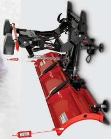
MIDWEIGHT STEEL PLOW SHOWN