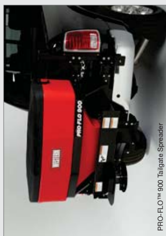
PRO-FLO™ 900 Tailgate Spreader

For large areas, the performance of a WESTERN hopper spreader can't be beat. Choose from poly or stainless steel models.