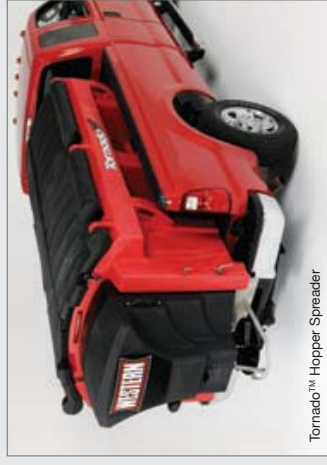
Tornado™ Hopper Spreader

Quality ice control equipment is essential to providing the conditions your customers demand.