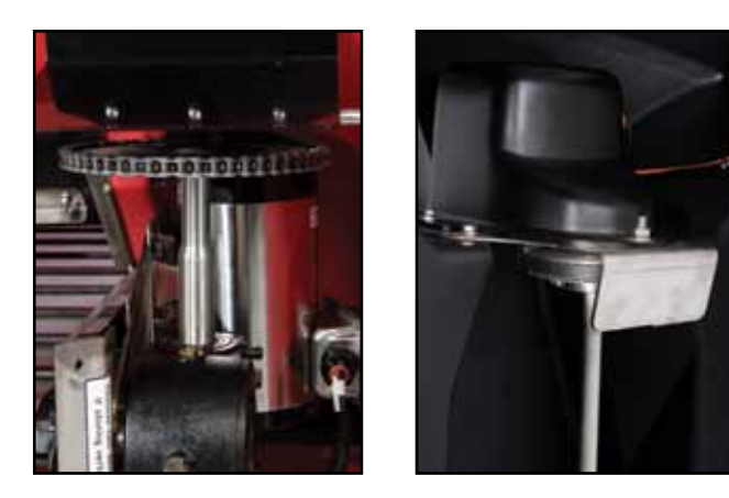
DUAL ELECTRIC MOTORS power the conveyor and spinner, giving you independent control of material delivery and spinner speed. Electric motors mean low maintenance and reliable starting.

features a rust-proof 15½" poly spinner. The entire assembly is height adjustable for pickup and flatbed trucks, and is easily removed for off-season storage.