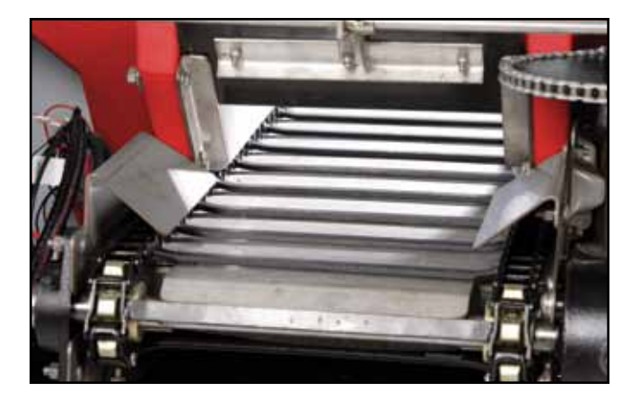
STEEL PINTLE CHAIN CONVEYOR and corrosionresistant stainless steel housing provide strength, reliability, and consistent material flow.

The TORNADO spreader is available in 7- and 8-foot lengths, with 1.5-, 1.8- and 2.5-cubic yard capacities, so you can choose the perfect fit for your needs.