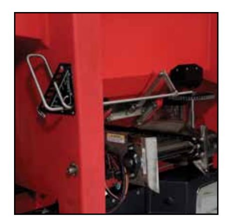
ADJUSTABLE FEED GATE regulates material flow to your exact requirements.

STANDARD TOP SCREEN breaks up large material chunks for better flow.