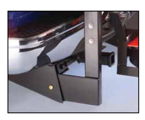
FRAME MOUNT The under-bed frame mount the PRO-FLO™ 2.

VARIABLE SPEED CONTROL Available as one of two control options on the PRO-FLO<sup>™</sup> 2.