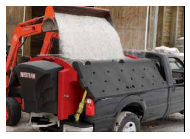
OPEN POLY HOPPER COVERS protect the truck bed from material overflow during loading.

STANDARD TOP SCREEN breaks up large material chunks for better flow.