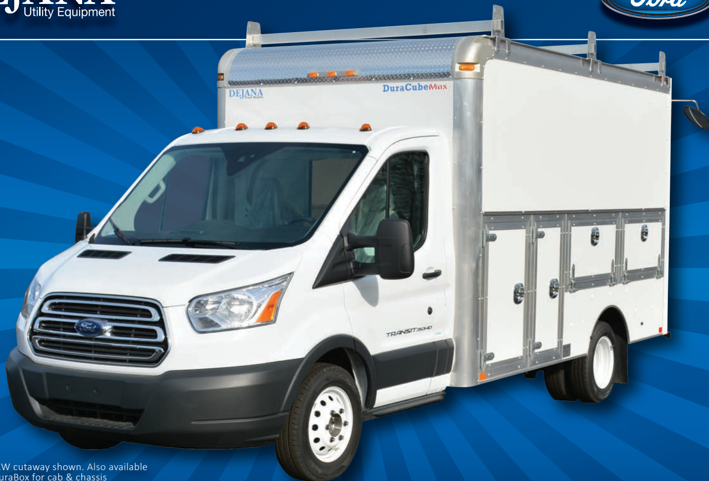
12' DRW cutaway shown. Also available as a DuraBox for cab & chassis