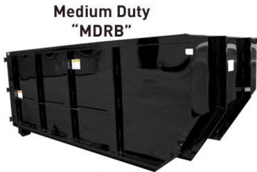
Medium Duty "MDRB"