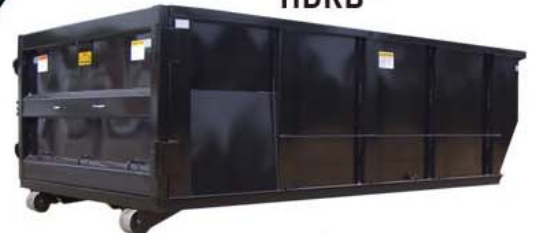
Heavy Duty "HDRB"