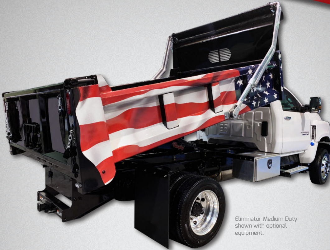
Eliminator Medium Duty shown with optional equipment.