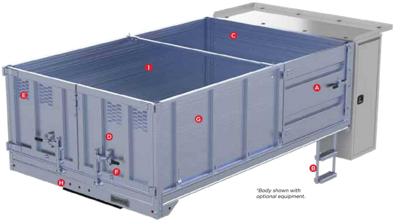
*Body shown with optional equipment.

resulting in a body that is 40% lighter than steel, returning payload back to the operator