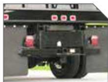
COMBINATION CLASS V HITCH AND ICC BUMPER