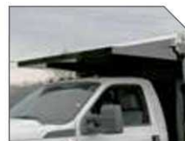
42" CAB PROTECTOR WITH 4 TIE DOWNS