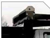
PULL TARP SYSTEM