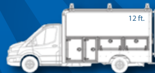
12' - R7P/ 156" WB/ 100.2" CA/SRW 12' - F8P/ 156" WB/ 100.2" CA/DRW