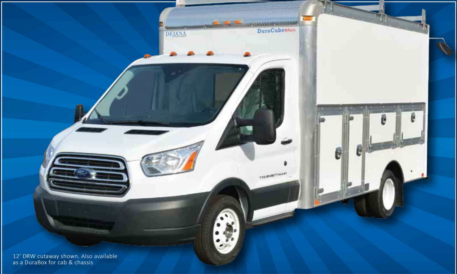
12' DRW cutaway shown. Also available as a DuraBox for cab & chassis