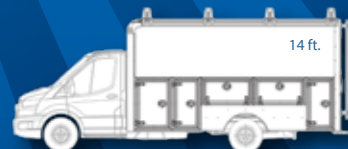
14' - F8P/ 156" WB/ 100.2" CA/DRW