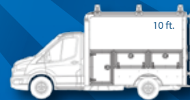
10' - R5P/ 138" WB/ 82.5" CA/SRW 10' - F6P/ 138" WB/ 82.5" CA/DRW

1 24" w x 37.5" h | 2 17" w x 37.5" h | 3 37.5" w x 17" h