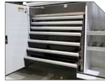
ADDITIONAL MECHANIC DRAWERS