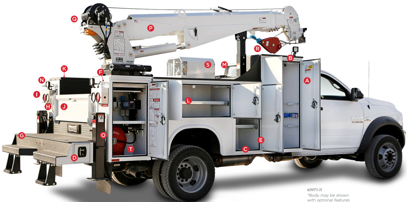
KMT1-11 *Body may be shown with optional features

Ram chassis are compatible with KMS16, KMS30 and KMT1 models.