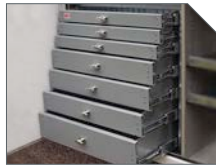
STEEL MECHANIC DRAWERS