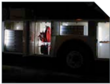
LED COMPARTMENT LIGHTS