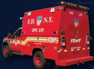
Fire & Rescue