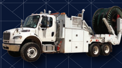
Cable Pullers & Reel Loaders