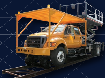
Railroad Trucks & Rail Gear