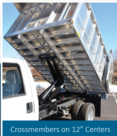
Crossmembers on 12" Centers