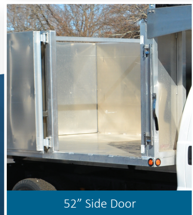
52" Side Door