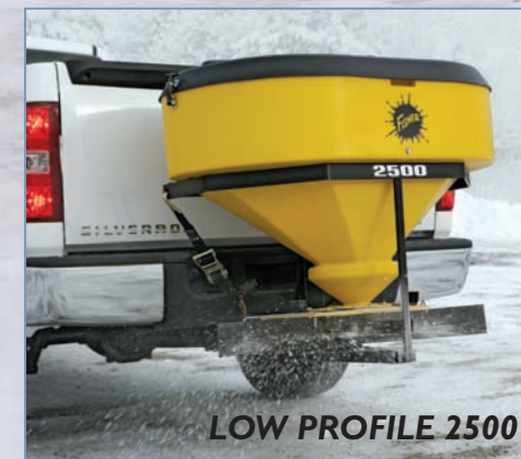
LOW PROFILE 2500