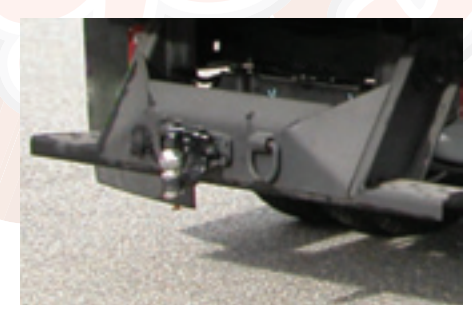
Pintle and Receiver Hitch Plates