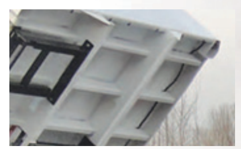
The Rugby Landscape Body's interlaced understructure provides added strength and rigidity.

Rugby's "Landscape Body" is the most versatile and accessible body available. All Rugby Landscape Bodies are designed to meet the toughest standards, featuring a curbside swing-out door and rear barn doors over a drop down tailgate that employs Rugby's revolutionary EZ-Latch system on the upper pins.