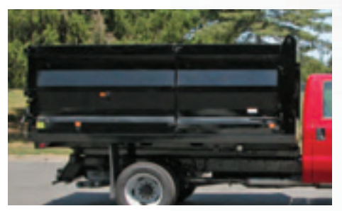
Durable 14 gauge steel front and side construction helps the Rugby Landscape Body stand up to the toughest working conditions.