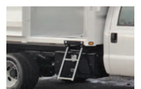
Two Rung Ladders