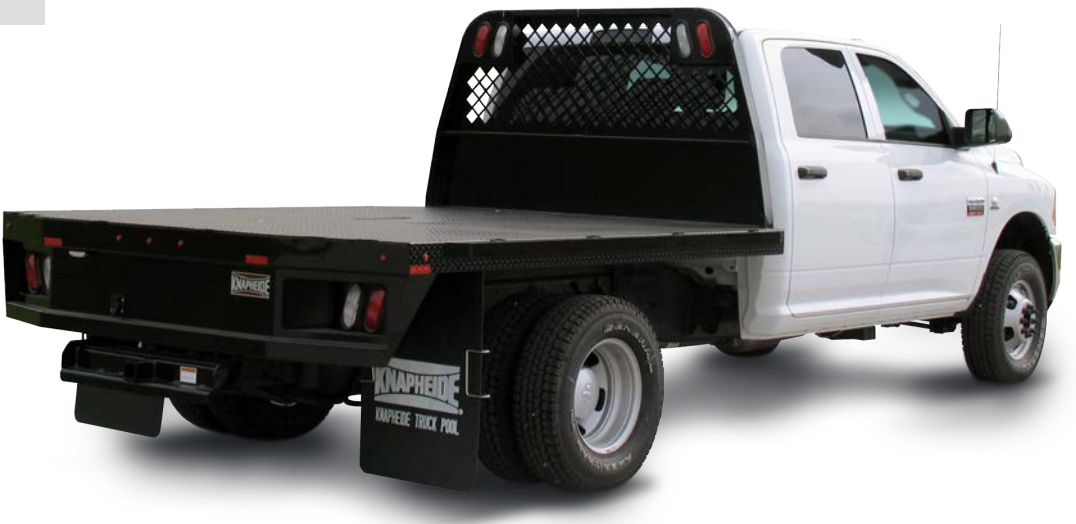
*Body may be shown with optional features