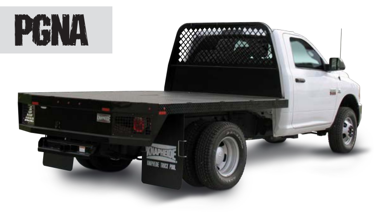
*Body may be shown with optional features