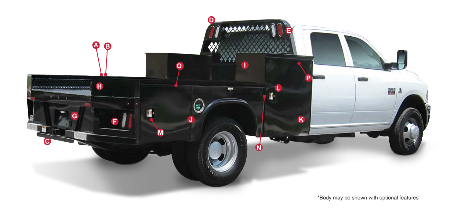
*Body may be shown with optional features

Our Gooseneck Bodies offer various levels of storage capabilities so you can choose the body that best fits your job. PGNA and PGNB models offer basic hauling functionality. Enhance the look and storage capacity of your body by choosing the PGNC or PGND model.