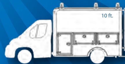
10' - VF3L32/ 136"WB/ 81" CA/ SRW