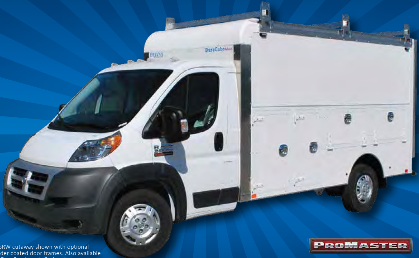
12' SRW cutaway shown with optional powder coated door frames. Also available as a DuraBox for cab & chassis