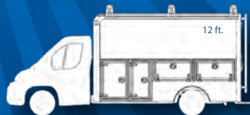
12' - VF3L34/ 159"WB/ 104" CA/ SRW